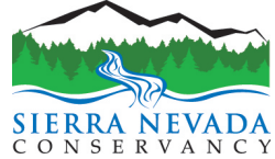
SIERRA NEVADA CONSERVANCY